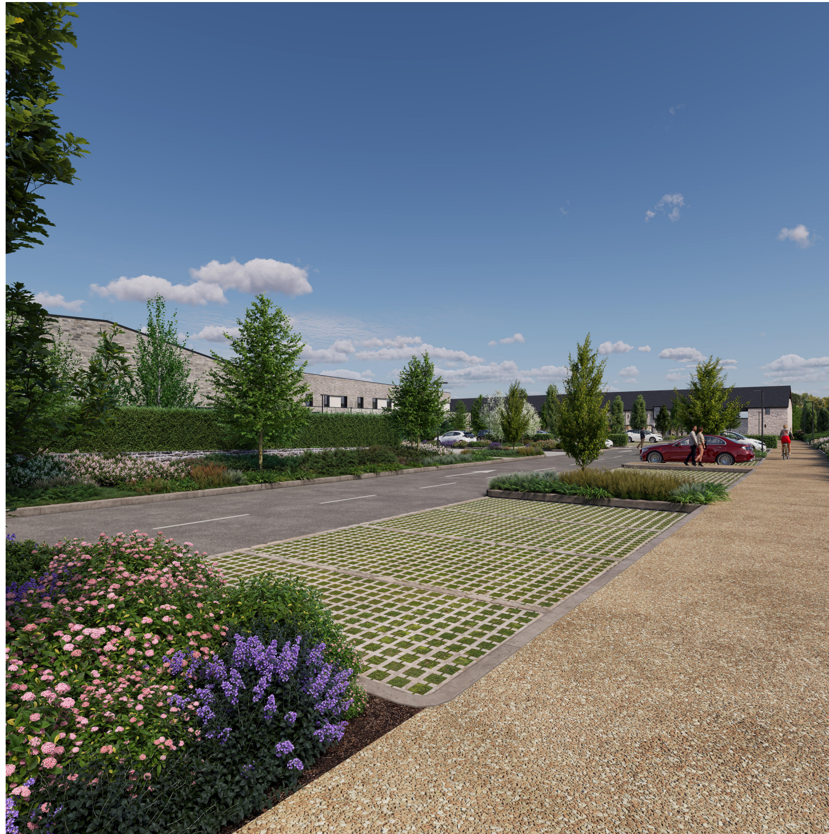
200-bed Adult In-Patient Hospital Entrance Approach From St Edmundsbury Walking Loop